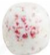
cinnabar in dolomite