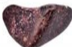
piemontite (manganesian epidote)