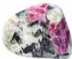
corundum in quartz