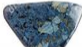
rhodusite (blue asbestos)