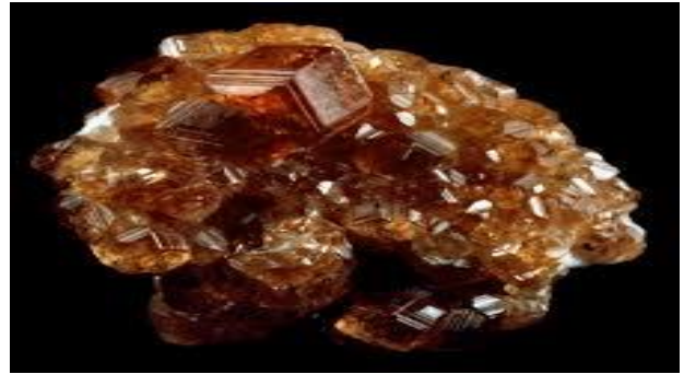
Quartz jaune ou citrine