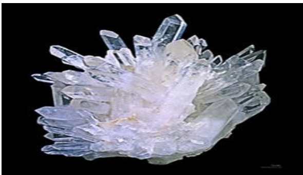
Cristaux de quartz hyalin