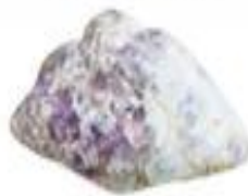
lepidolite and tourmaline in quartz