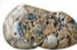
sphalerite with galena