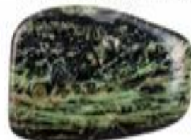
rhyolite (madagascar, jasper)