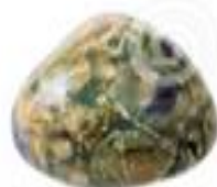
rhyolite (rainforest jasper)