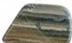
marl shale (marlstone)