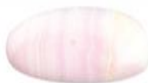
mangano calcite (manganocalcite)