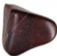
jaspillite ferruginous quartzite