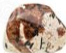
spreushtein with microcline