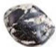
aegirine in microcline