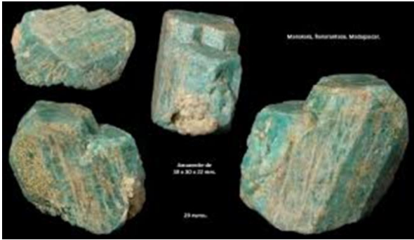
Macle de feldspath